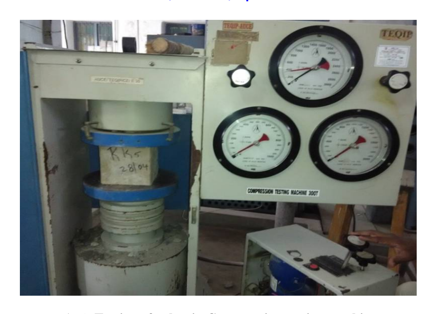
Fig 1. Testing of cubes in Compression testing machine

The cubes are tested in the Compression Testing Machine to determine their compressive strength at 3, 7 and 28days for various mix designs with varying replacement of conventional sand with foundry sand i.e, SCC0, SCC25, SCC50, SCC75 and SCC100.